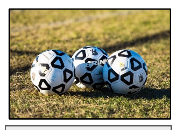
Men's Soccer 8am - 10am