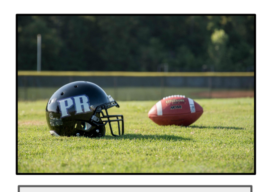
Football 7:30 am - 11:30 am