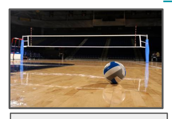
Volleyball 10am - Noon