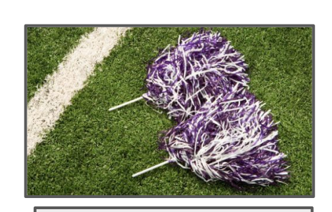
Cheer 3:30 - 5:30